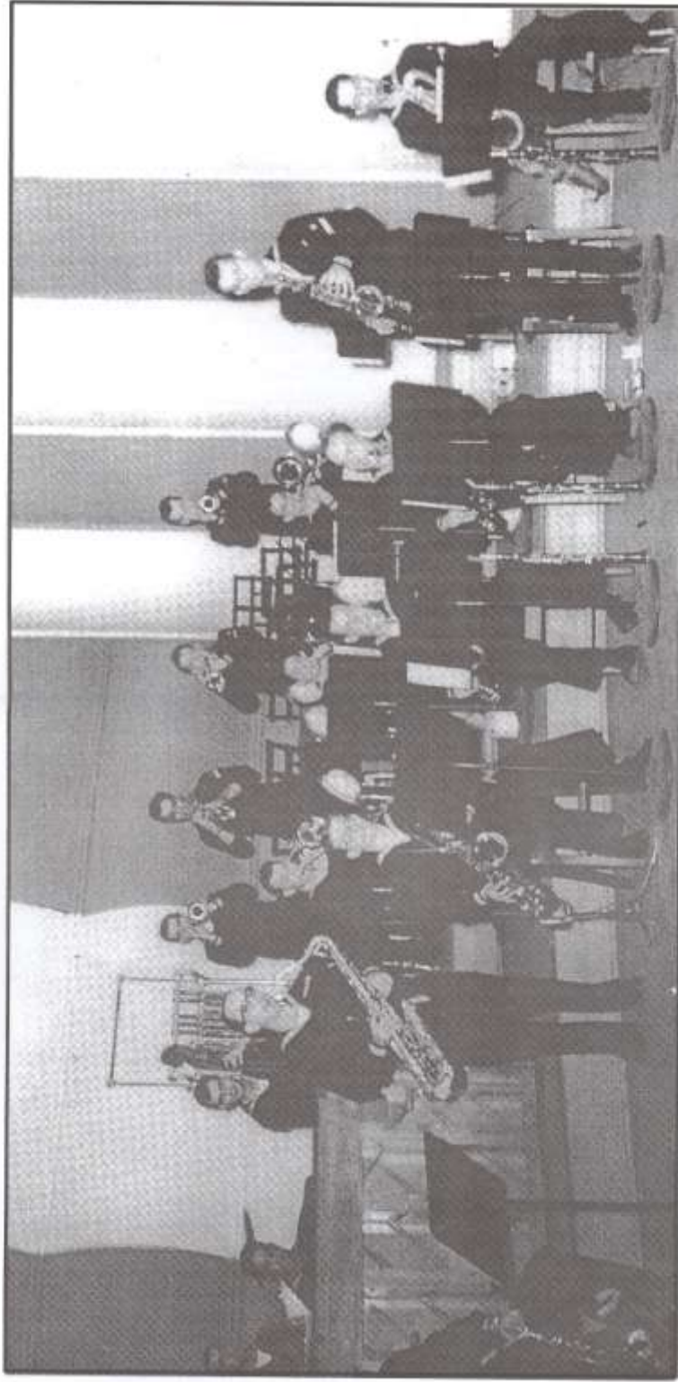
Dance Band 2-4 A, Anacostia (1952)