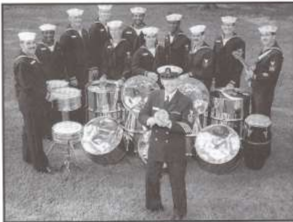
<New Orleans, LA (1988)

The duty rumor now is that the Steel Band may again be reborn either with the Navy or with another branch of the armed forces. Let's hope so! This was a wonderful band and I as well as many past members of the Steel Band have great memories of it.