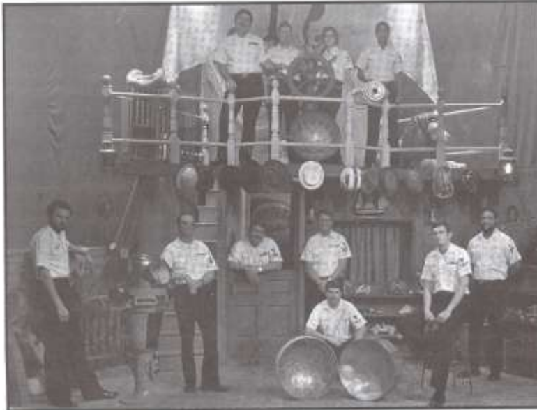
<Captain Noah TV Show Philadelphia, PA (ca 1980)