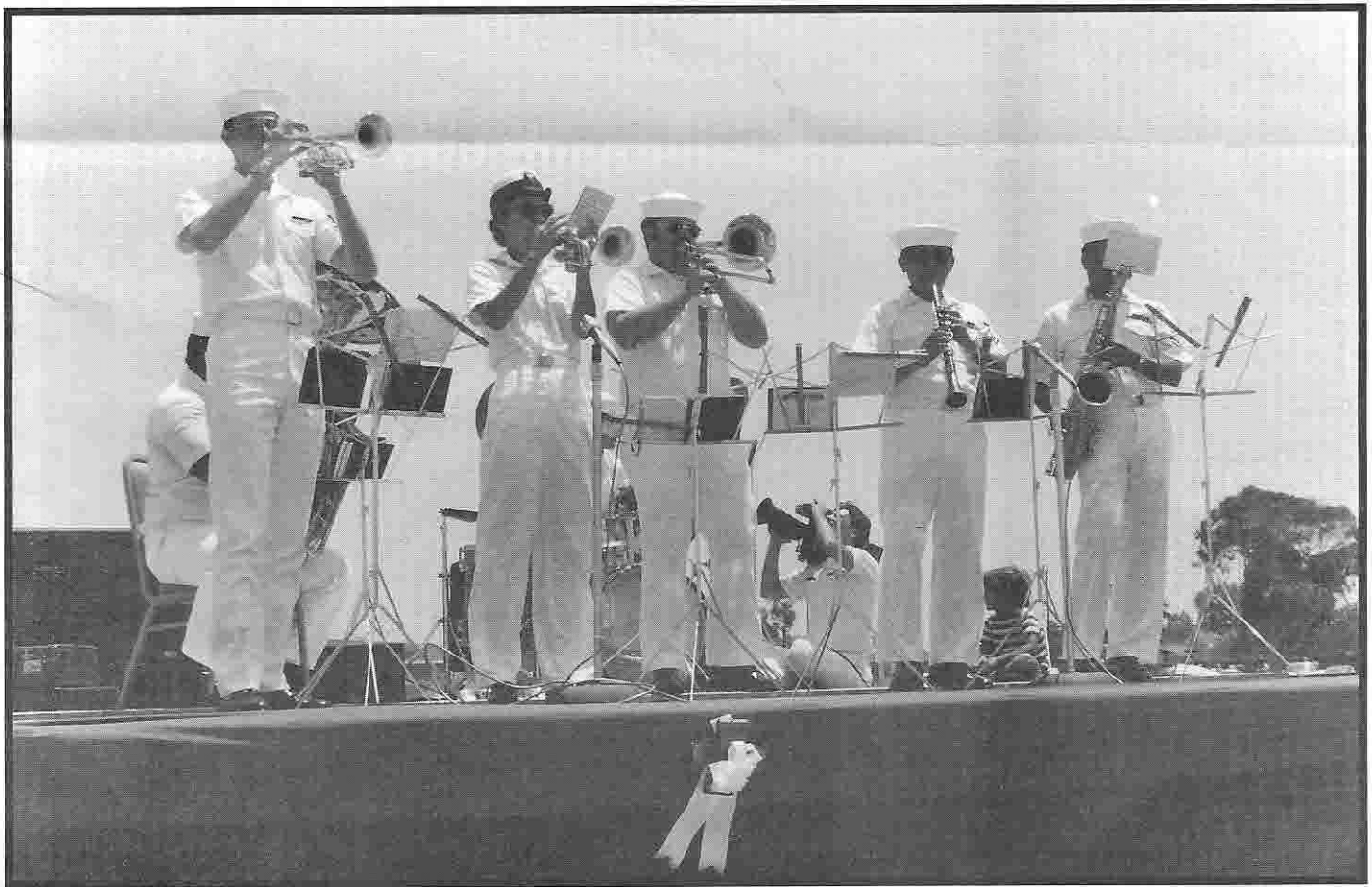
DIXIE BAND (NTC San Diego) 1983 NAS NI Armed Forces Day