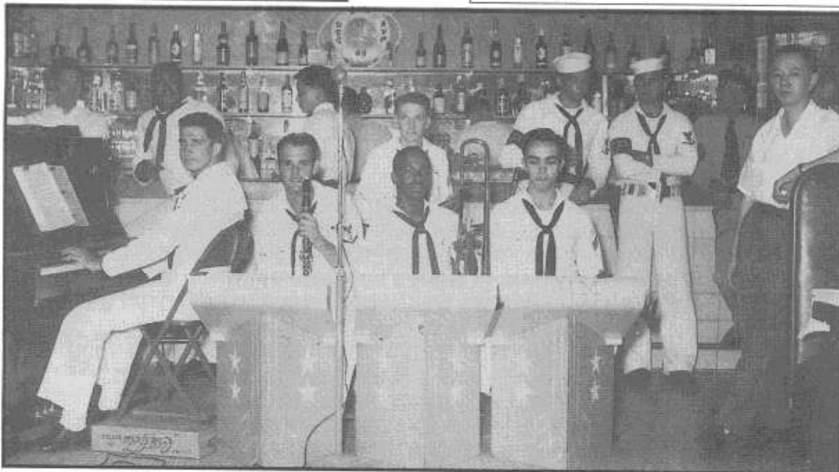
COM CRU DIV 3 Combo at a non-union pay gig in Hong Kong in October 1953.