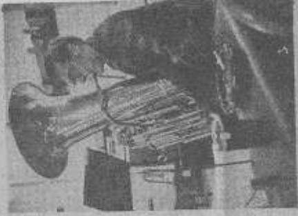
Donohoo on tuba