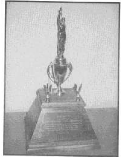
Above is a replica of the trophy that was presented to Lachenmayer, Albert, Emond, and Huddleston at a re-creation of December 6, 1941, at the sub base in Pearl Harbor on December 6, 1991 (the 50th anniversary of Pearl Harbor).