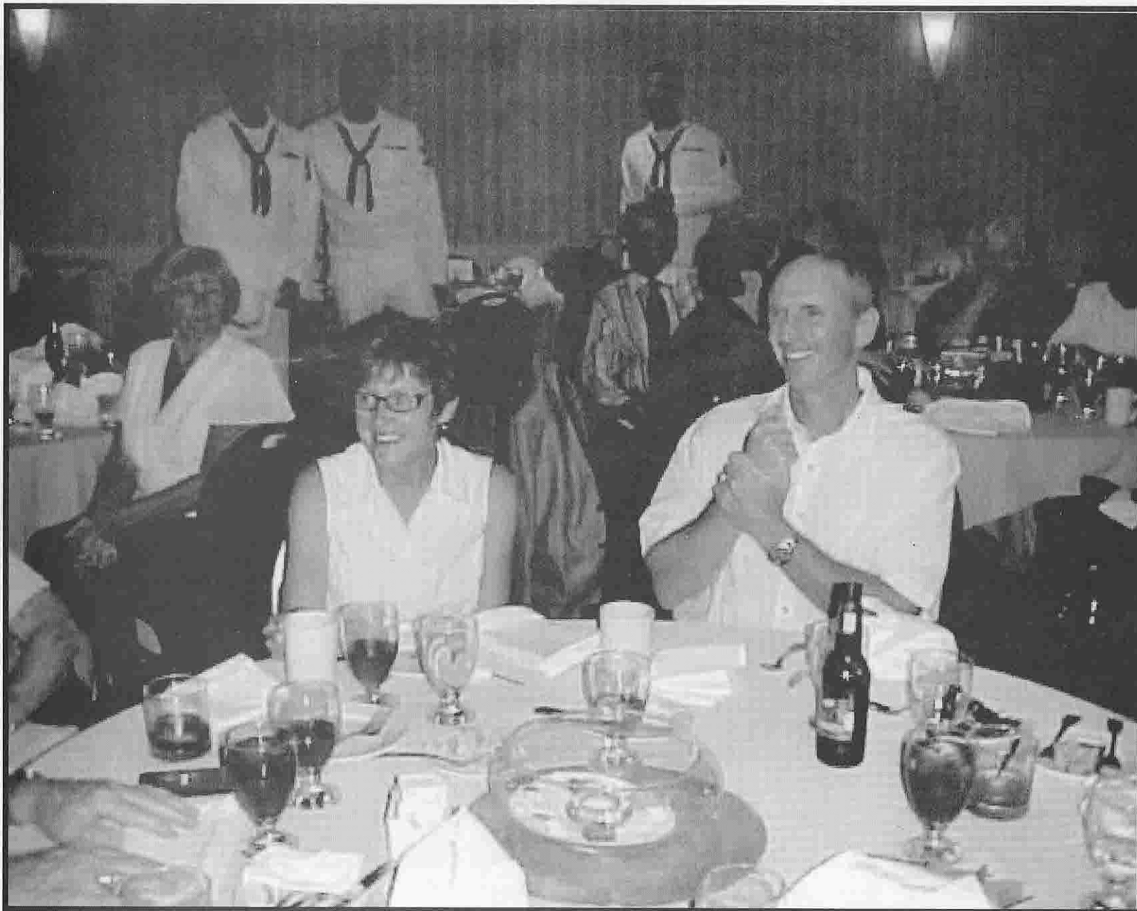
Commander Fleet Forces Atlantic Fleet Admiral and Mrs. Greenert, our guests at the banquet at the June 2009 Reunion. Admiral Greenert was headed to Washington, DC, for a Vice CNO slot. It was Mrs Greenert's birthday and we sang "Happy Birthday" to her. Their attendance was appreciated and he and his wife were cordial and responsive.